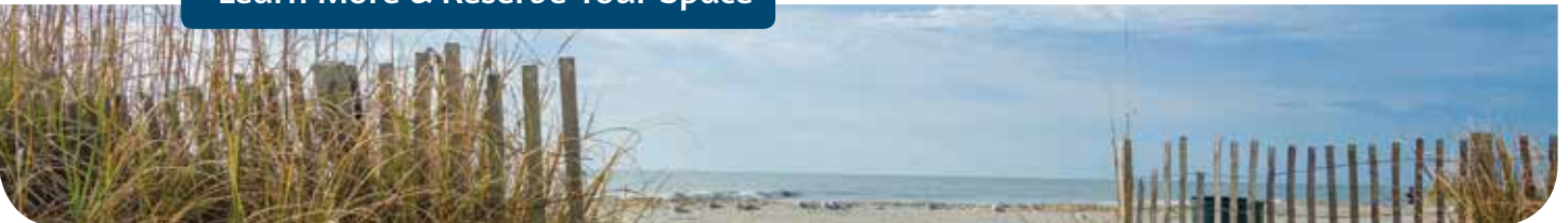
Exhibit Dates April 22 & 23, 2020